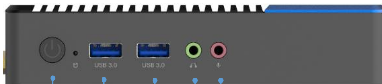
Power Button USB3.0 USB3.0 Lineout Mic in